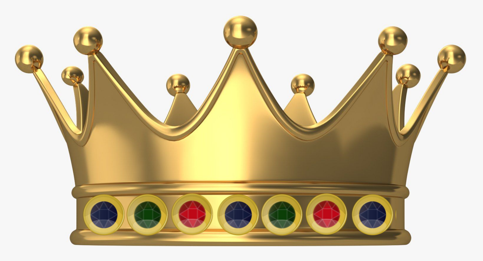
The CROWN is the goal!